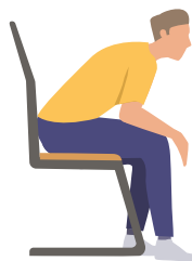
Forward lean 2