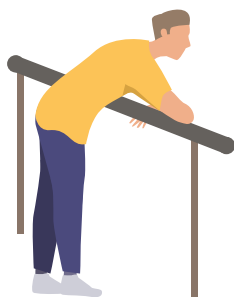
Forward lean 1