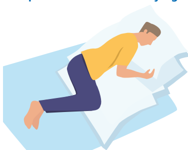
Adapted forward lean for lying